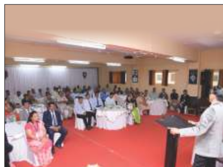
Participant in NAAC State Level Seminar @ IBMRD