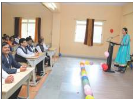
Teachers day celebration @ IBMRD