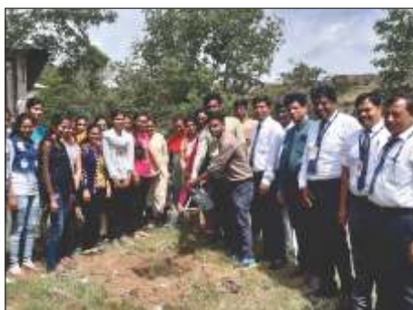
Tree plantation @ IBMRD