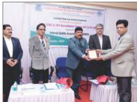
NAAC State Level Conf @ IBMRD