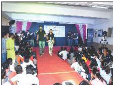
Spandan Mex 2020