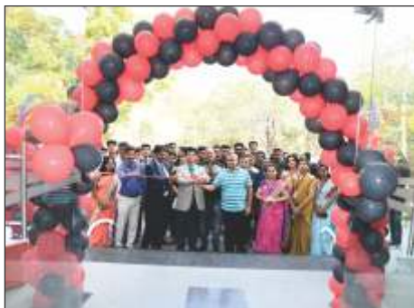
IBMRD Spanden 2020