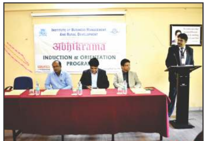
Induction Program @ IBMRD