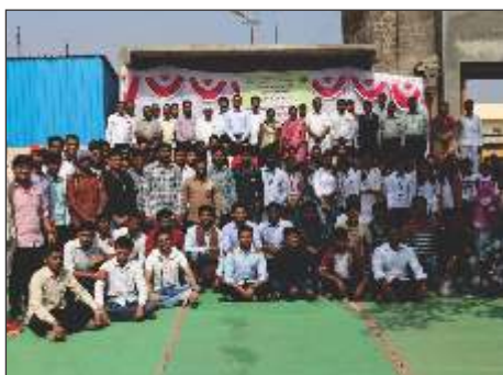
NSS at Akolner