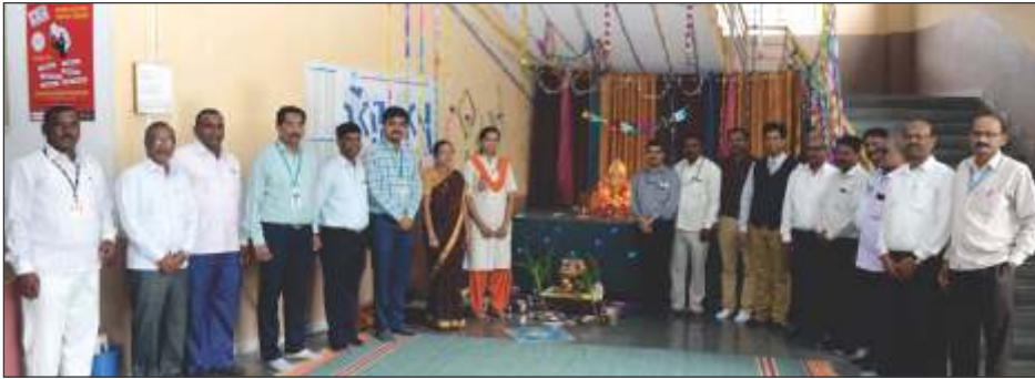
Shree Ganesh Festival @ IBMRD