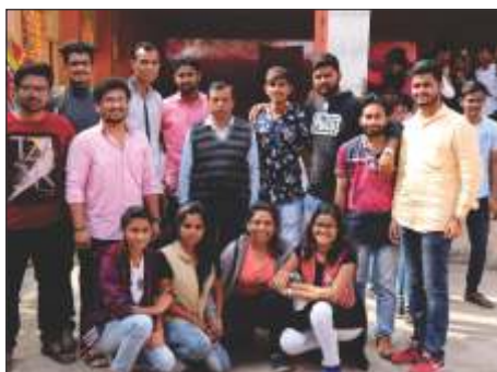
NSS Camp @ Akolner