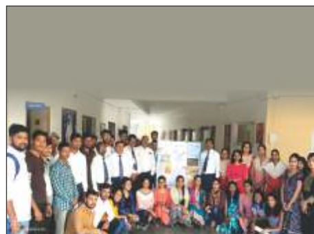
Women empowerment @ IBMRD