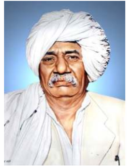
LATE DR. VITHALRAO VIKHE PATIL

Therefore, Padmashree began exploring ways of uplifting the farmers of this region. It dawned on him that co-operative movement was the only ideal medium to reach his end. Thus, led off the saga of co-operative movement in India. He initiated the cooperative movement as a tool for social, educational & economic upliftment of the rural masses. His untiring efforts changed the rural scene of Maharashtra and created awareness amongst the people to guide a prospective purposeful life. He was awarded "Padmashree" - the distinguished title in appreciation of his life's work with the co-operative movement, honored by President of India, Late. Dr. Rajendra Prasad in 1961. He was felicitated with the honorary D.Lit. degree by University of Pune in 1978 and Doctor of Science in 1979 by Mahatma Phule Krishi Vidyapeeth, Rahuri. To realize the visionary thoughts, his worthy son - Late Padmabhushan Shri. Balasaheb Vikhe Patil, then Minister of Heavy Industries and Public Enterprises, established "Dr. Vithalrao Vikhe Patil Foundation". While working for the economic prosperity of the farmers, Padmashree Vithalrao was also conscious of the needs of their children, especially that of quality education. It was not long before he once again used his co-operative mantra to ensure the direct participation of the sodbusters in this project. The farmers contributed towards the education fund from every tonne of the sugar can sent to the factory.