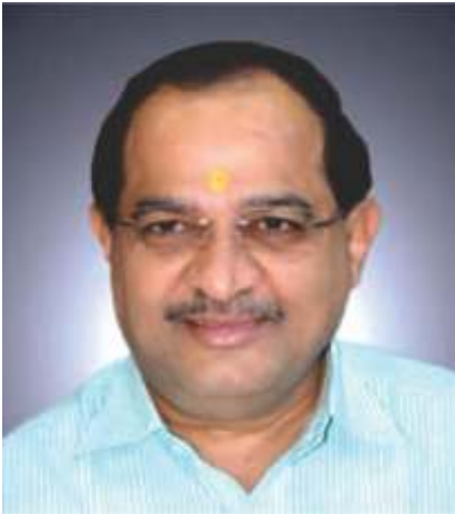
Hon'ble SHRI. RADHAKRISHNA EKNATHRAO VIKHE PATIL Executive Chairman & Trustee D.V.V.P. Foundation, Ahmednagar. Member of Legislative Assembly, Maharashtra

Knowledge is the driving force in the rapidly changing globalized economy and social hub. Quantity and quality for specialized human resources determine their competence in the global market.