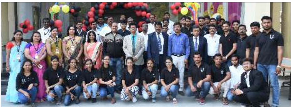
IBMRD Spandan Mex 2020