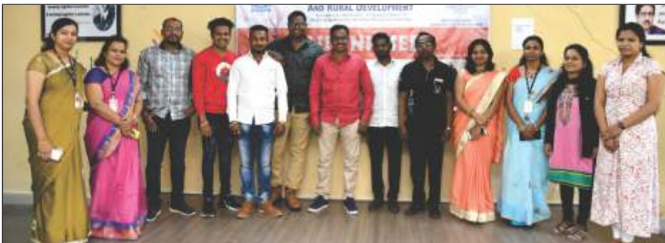
Alumni Meet 2020