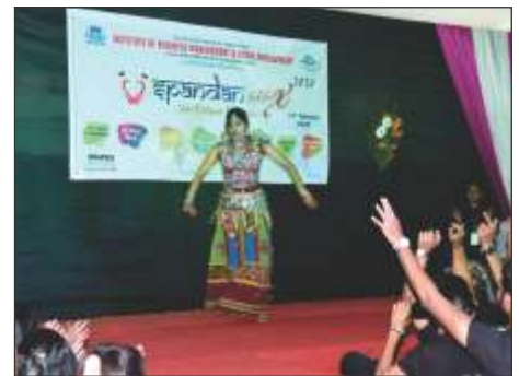
Solo Dance Performance Spandan Mex 2020 @ IBMRD