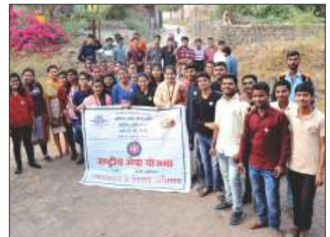
Students Activities @ NSS Champ, Akolner