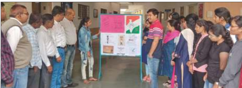
Gender equality @ IBMRD