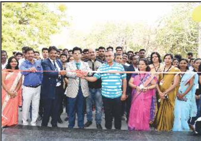
IBMRD Spandan 2020

With a view to promote entrepreneurship, our Institute has started Entrepreneurship Cell at the Institute level in the year 2009. Since then, our Institute had organized several campaigns & workshop in collaboration with MCED (Maharashtra Entrepreneurship Development) & MSME (Micro small and Medium Enterprisers).