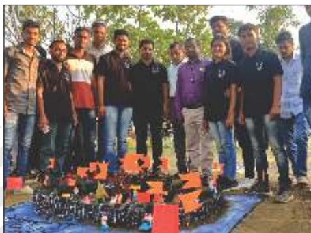
Fort making competition won by IBMRD students