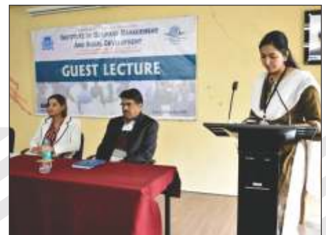
Guest lecture @ IBMRD