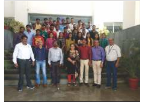
Industrial Visit at Nashik