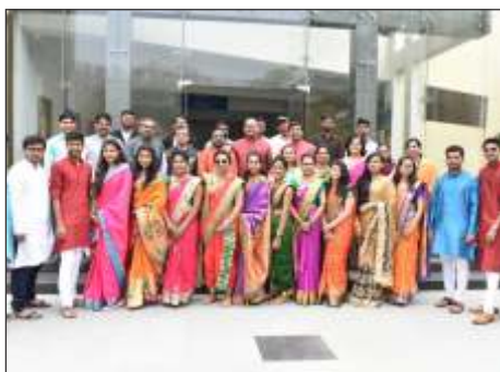
Traditional day @ IBMRD